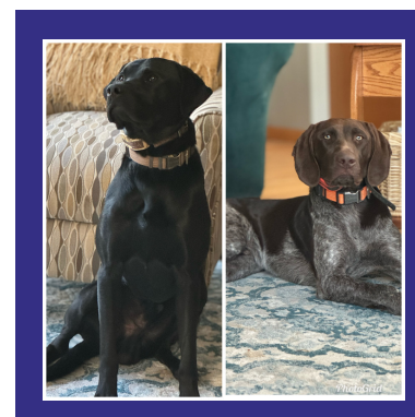
Dexter and Drake